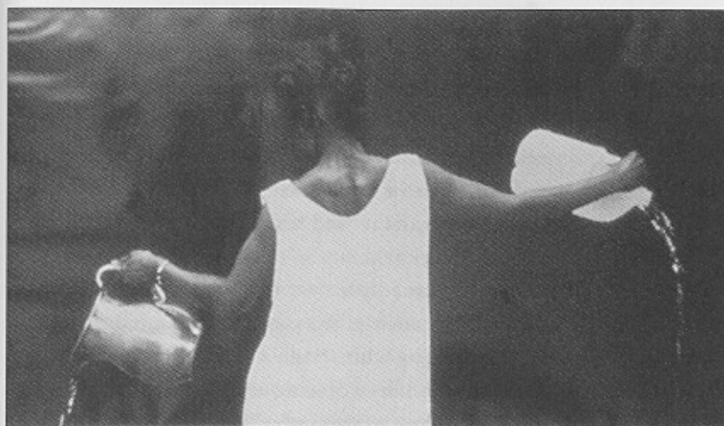
Lorna Simpson. The Waterbearer. 1986. Silver print. 40 1/2" x 70." Courtesy of the artist.

Here in this image the keeper of history, the griot, the one who bears water as life and blessing, is a black woman. Her knowledge threatens, cannot be heard. She cannot bear witness. She is refused that place of authority and voice that would allow her to be a subject in history. Or so the phrases suggest. Yet this refusal is interrogated by the intensity of the image, and by the woman's defiant stance. By turning her back on those who cannot hear